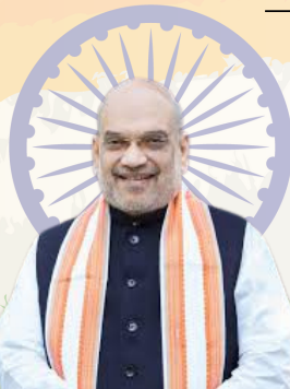
Sh. Amit Shah