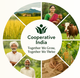
Strengthening rural economy through cooperative movements