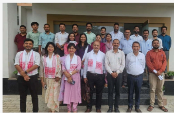
A Group photo of on going 45-Day Training Programme on Accounts & Audit for Cooperative officers from Govt. of Assam and Arunachal Pradesh