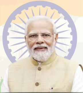
Sh. Narendra Modi