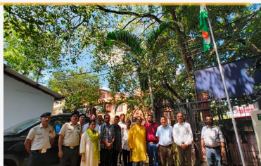
A view of the celebration of 79 th Independence day at ICM, Guwahati Premises at Gopinath Nagar, Guwhati-16